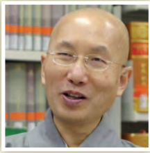
Venerable Sik Hin Hung (Hong Kong)

Buddhist Monk; Lineage Holder of the Ch'an Schools of Lingji and Guiyang